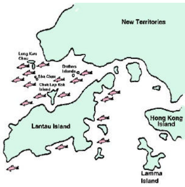
Figure 2. Map showing the location of Chinese White Dolphin in Hong Kong seas.

Over-fishing - A problem which is affecting fish stocks throughout the world but in Hong Kong there are no laws to limit the size of catches, nor restrictions on species captured. Fewer fish are being caught for human consumption, which also means less, are available for the dolphins. Reports from fishermen in the area are of dolphins feeding further out into Chinese waters and rarely visiting their previous grounds. One dolphin even broke a fishing net, disregarding its fear of fishermen in an attempt to satisfy its hunger!